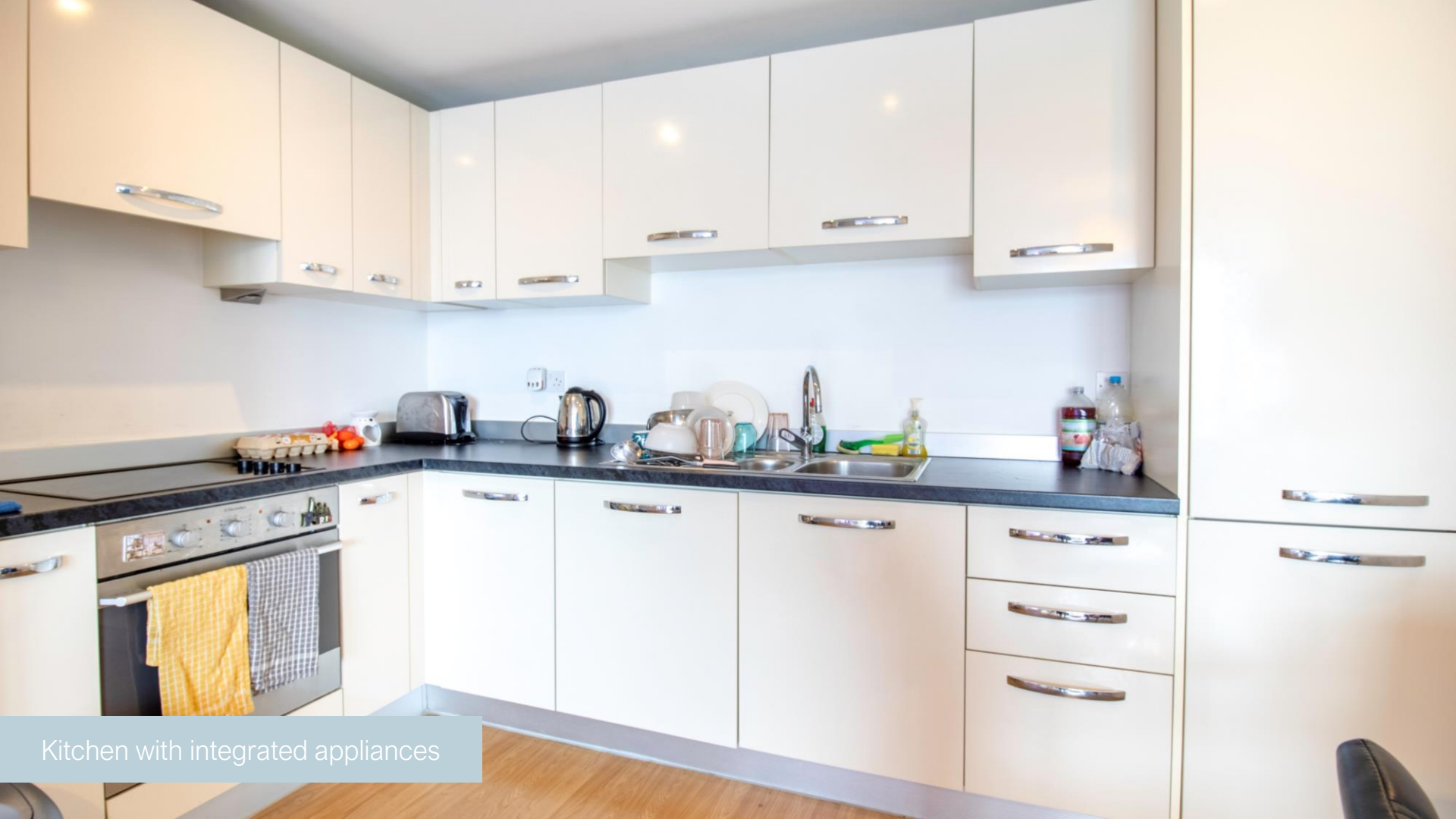
Kitchen with integrated appliances