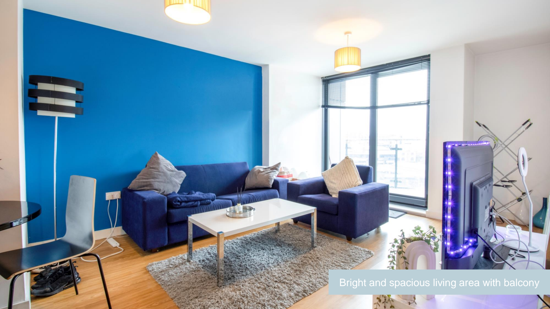
Bright and spacious living area with balcony