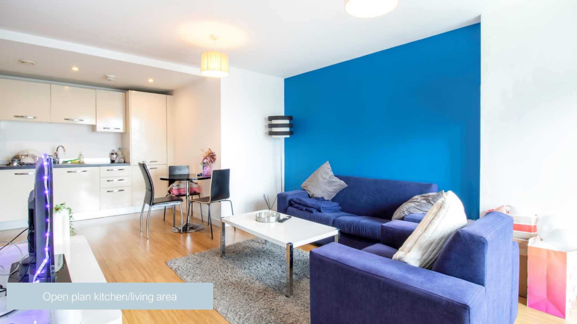
Open plan kitchen/living area