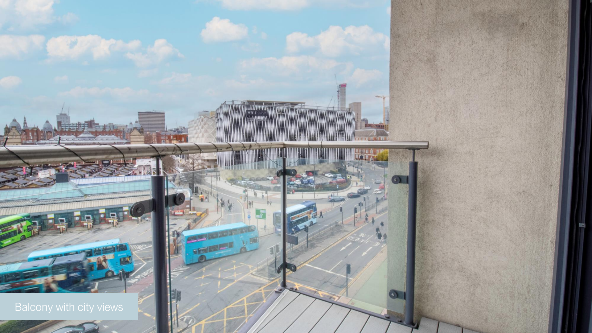
Balcony with city views